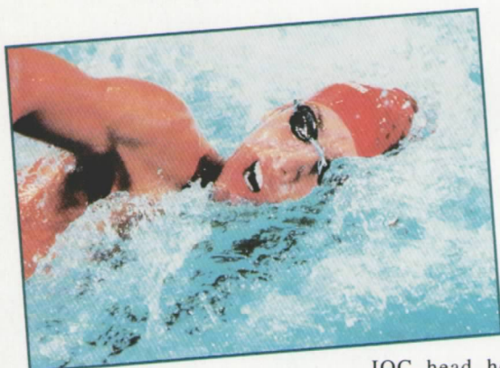
Grant Hackett (above) and Michael Klim (right)